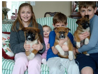
3 puppies with their foster family

Six puppies born in DelBarton, WV, were tossed outside during a very bitter cold snap this past January by the owner, who said he wanted them to die to save him the effort of killing them. They were miraculously saved by a local animal rescuer and brought to Pet Rescue for us to do what we do best, find them new lives and loving homes. Here are wonderful stories by the families who adopted some of these cute littermates.